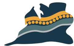
West Kimberley Futures EMPOWERED COMMUNITIES