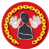
Kimberley Stolen Generation Aboriginal Corporation

The event was sponsored by AKO Consultancy, Kimberley Stolen Generation Aboriginal Corporation, Aarnja and EC-West to support 'bringing community members together following the Voice Referendum'.