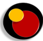
AKO Consultancy 'Achieve Key Outcomes'